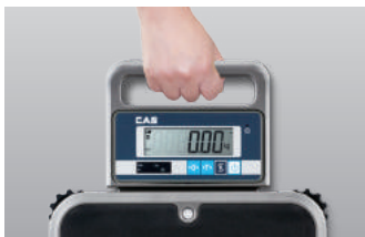
Easy to Carry

PBII is a portable bench scale, small and easy for carrying. The large and 180° reversible display increase the convenience of usage. PB can be connected to smartphone via Bluetooth. The smartphone app provides a variety of features including weight display, statistics and wireless printer connection and more (Bluetooth option).