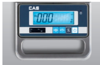
180° Reversible Display