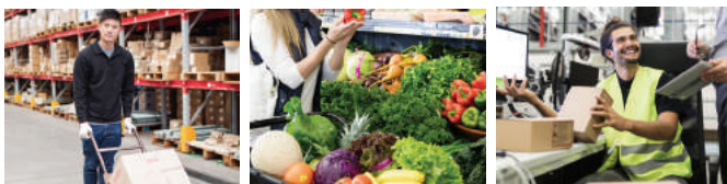
Parcel and Luggage Weighing