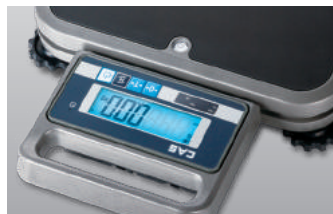
Large LCD with Backlight