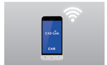
Bluetooth Communication (Option)